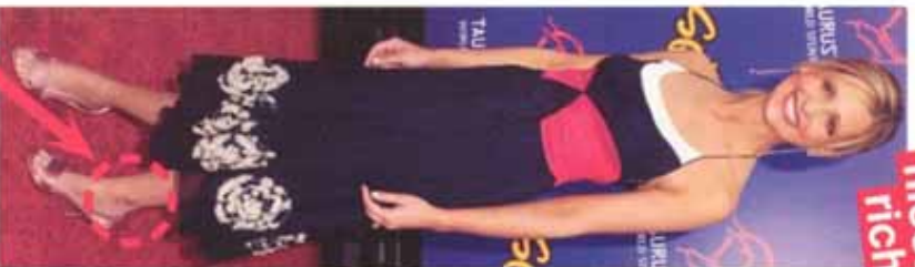
sarah michelle gellar

MARKING TIME NICOLE BOASTS NINE TATTOOS (INCLUDING ANGEL WINGS ON HER BACK), IN ADDITION TO THE HEART ON HER ANKLE. SARAH MICHELLE HAS A CHINESE SYMBOL FOR INTEGRITY, AND TWIN DRAGONFLIES. GISELE HAS A SMALL STAR INKED ON THE INSIDE OF HER LEFT WRIST. AND JAMES KING'S LAST NAME (AS WELL AS A STAR) IS INSCRIBED AT THE BASE OF HER NECK.